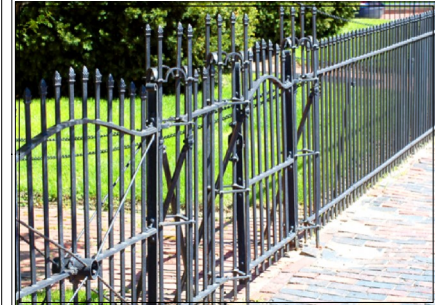
Wrought Iron - Open