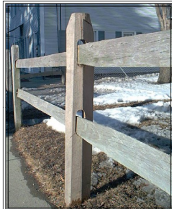
Post and Rail - Open