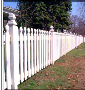
Picket - Open