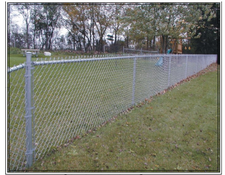
Chain Link - Open