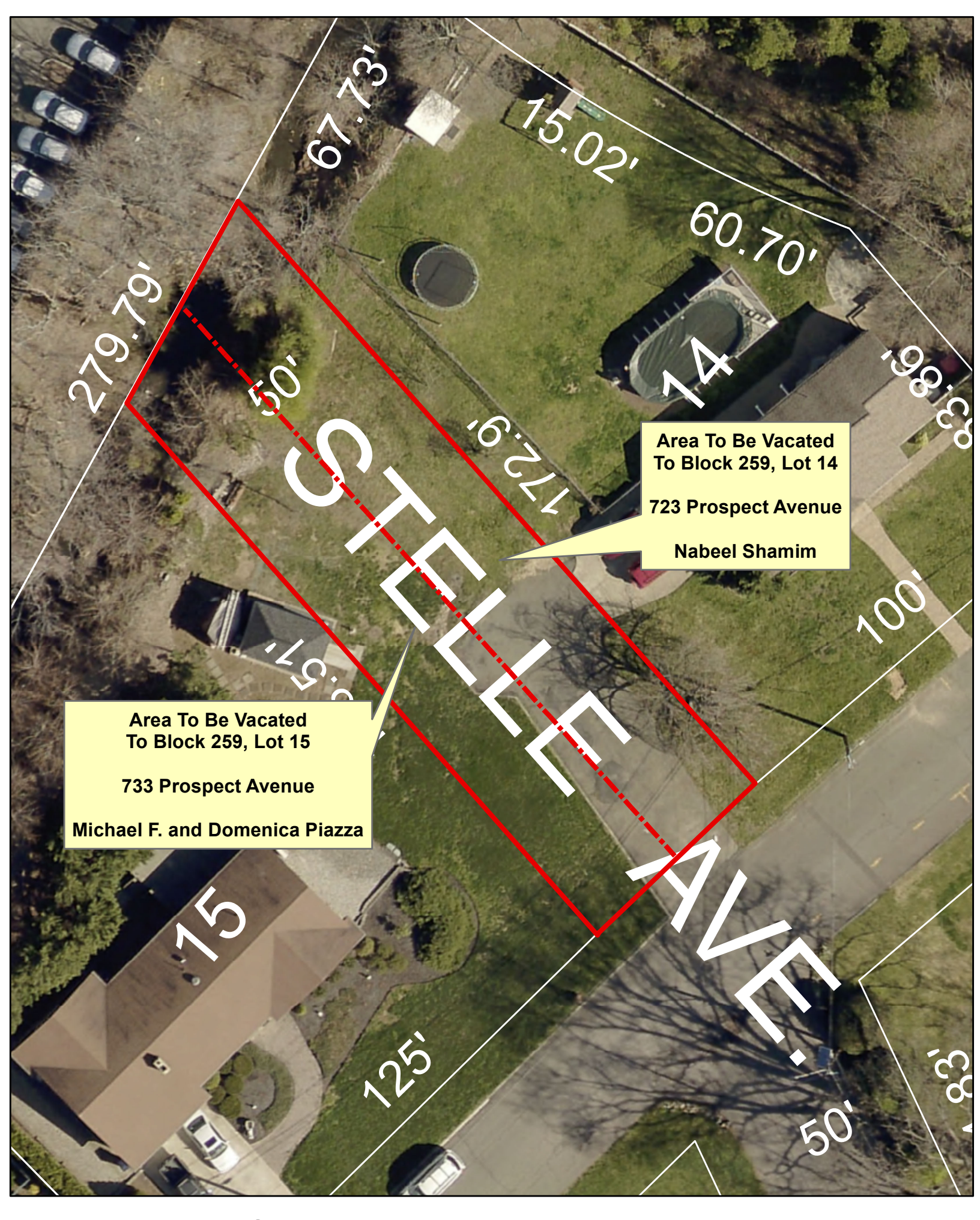
Stelle Avenue Vacation - Exhibit B