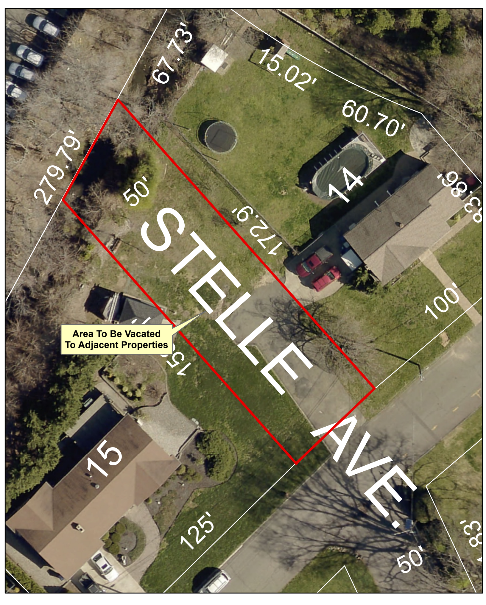
Stelle Avenue Vacation - Exhibit A