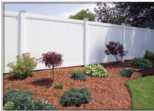
Stockade - Vinyl