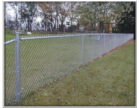
Chain Link - Open