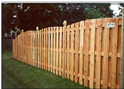
Board on Board