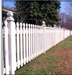
Picket - Open