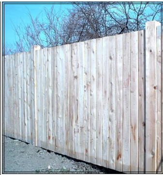
Stockade - Wood