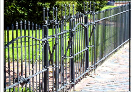
Wrought Iron - Open