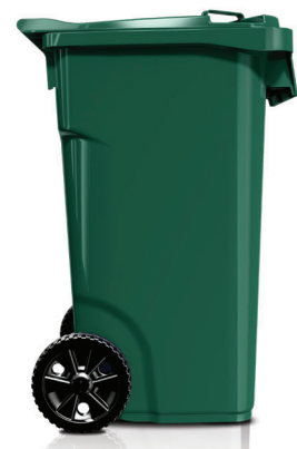
Green No. 335