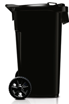
Black No. 099