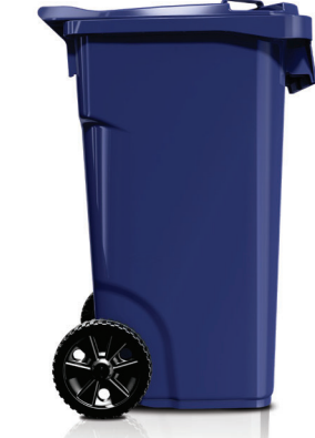
Blue No. 281