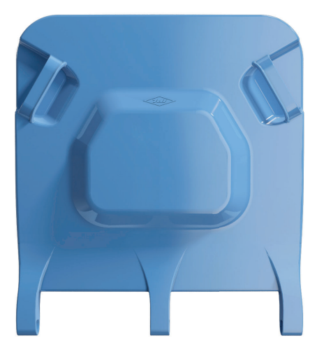
All colors available for all our lids and containers.

Ten optional colors available to differentiate carts while customizing appearance of products.