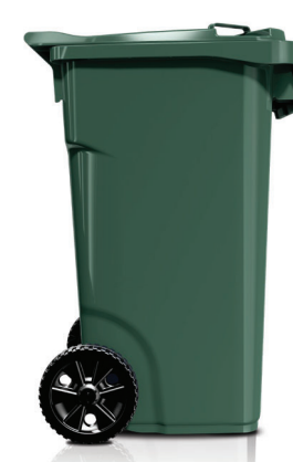
Green No. 561