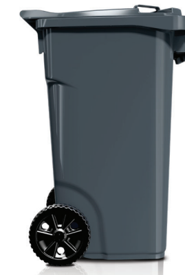
Grey No. 447