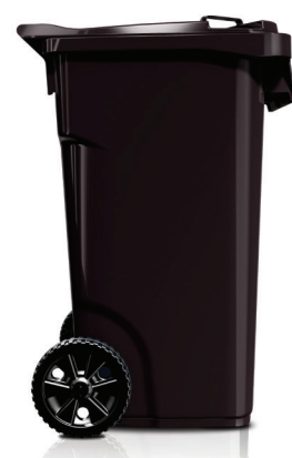
Brown No. 412

Colors and textures shown are as accurate as printing allows. Actual product colors and textures are subject to variation from color chip sample.