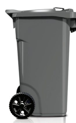
Grey No. 415