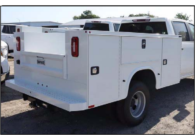
Utility Body Sold Separate