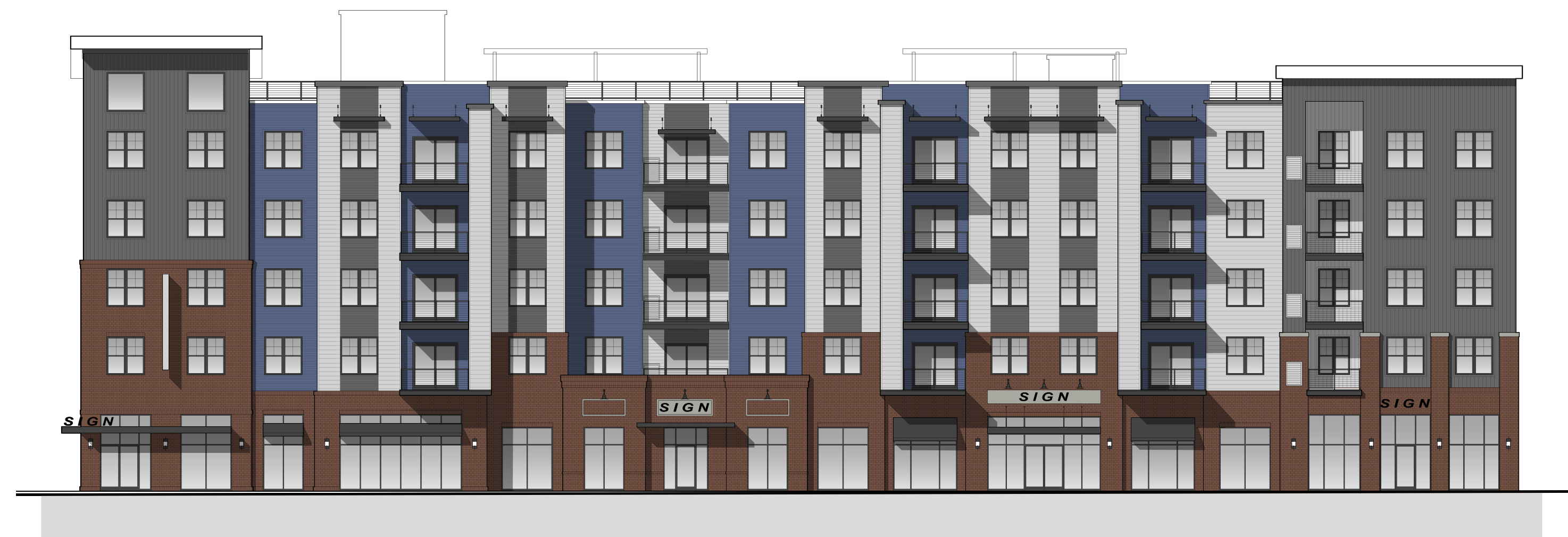
1 MAIN STREET ELEVATION Scale: 1/16" = 1'-0"

APPEL DESIGN GROUP - FILENAME: P:\CLIENT\GH-MAINSTREET\BOWLING BUILDING H-1\PLANS.DWG PLOT DATE: 02/02/2022 5:10 PM BY: MPM