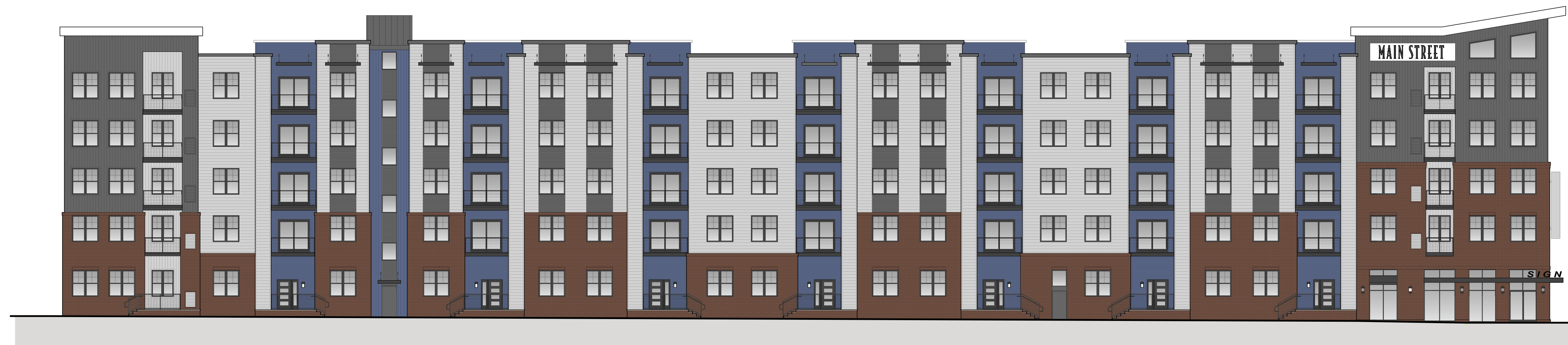
2 PLAZA CIRCLE ELEVATION Scale: 1/16" = 1'-0"