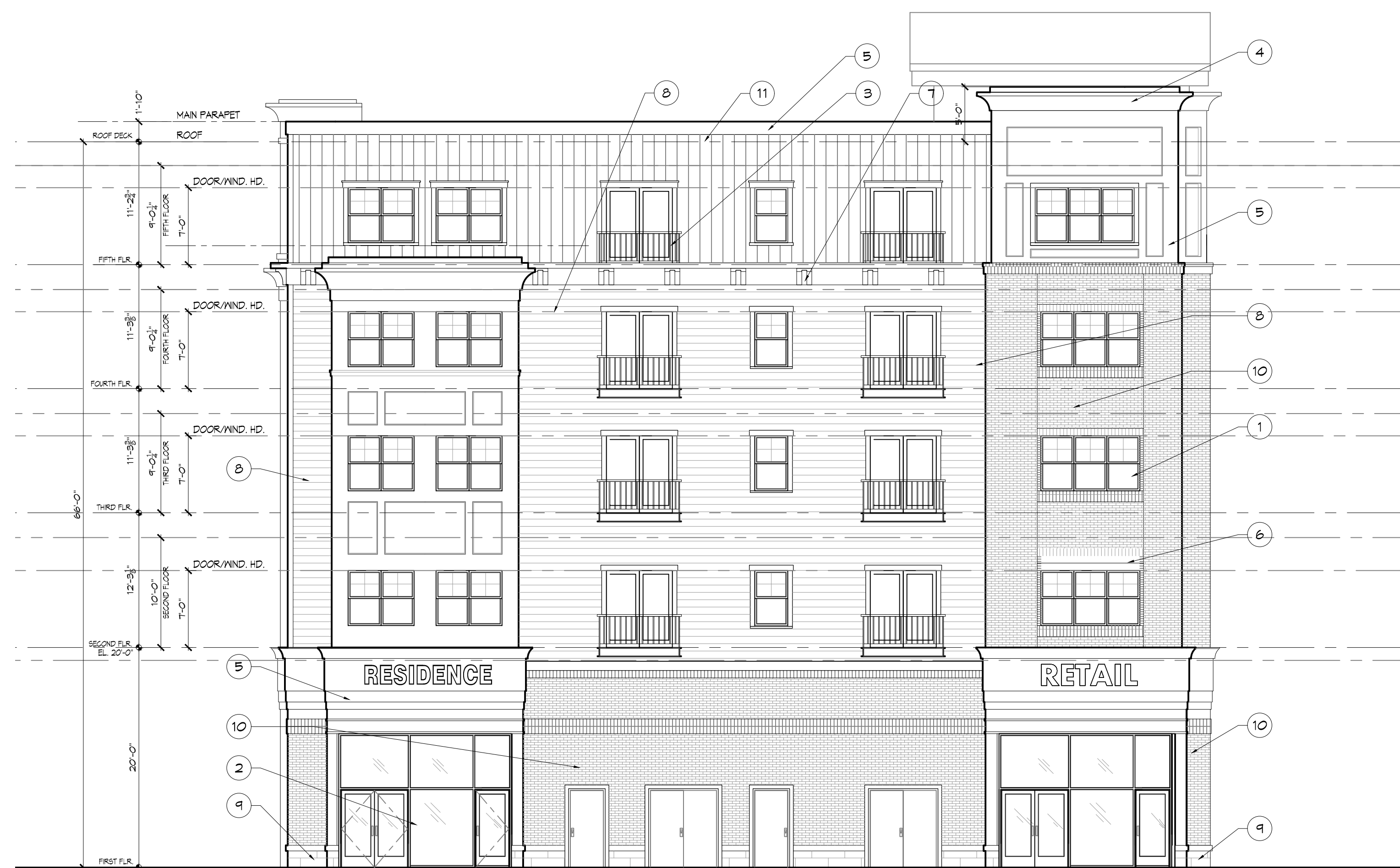
D NORTH ELEVATION SCALE: 1/8" = 1'-0"