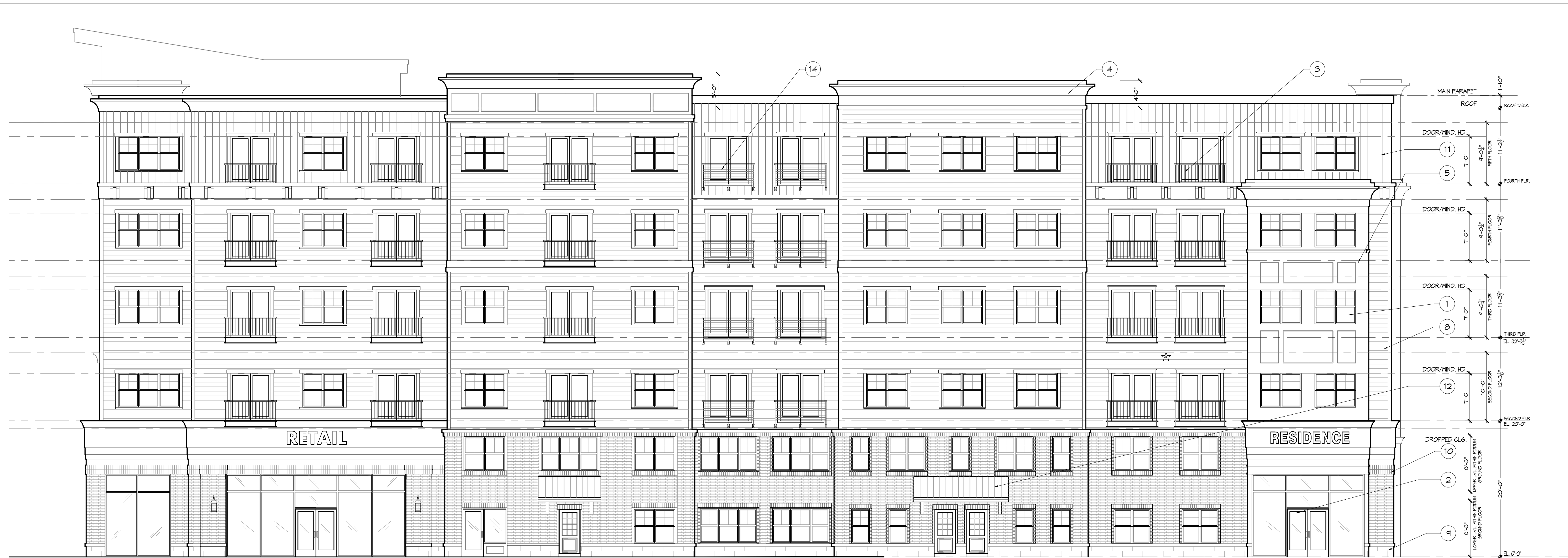
C EAST (PLAZA) ELEVATION SCALE: 1/8" = 1'-0"