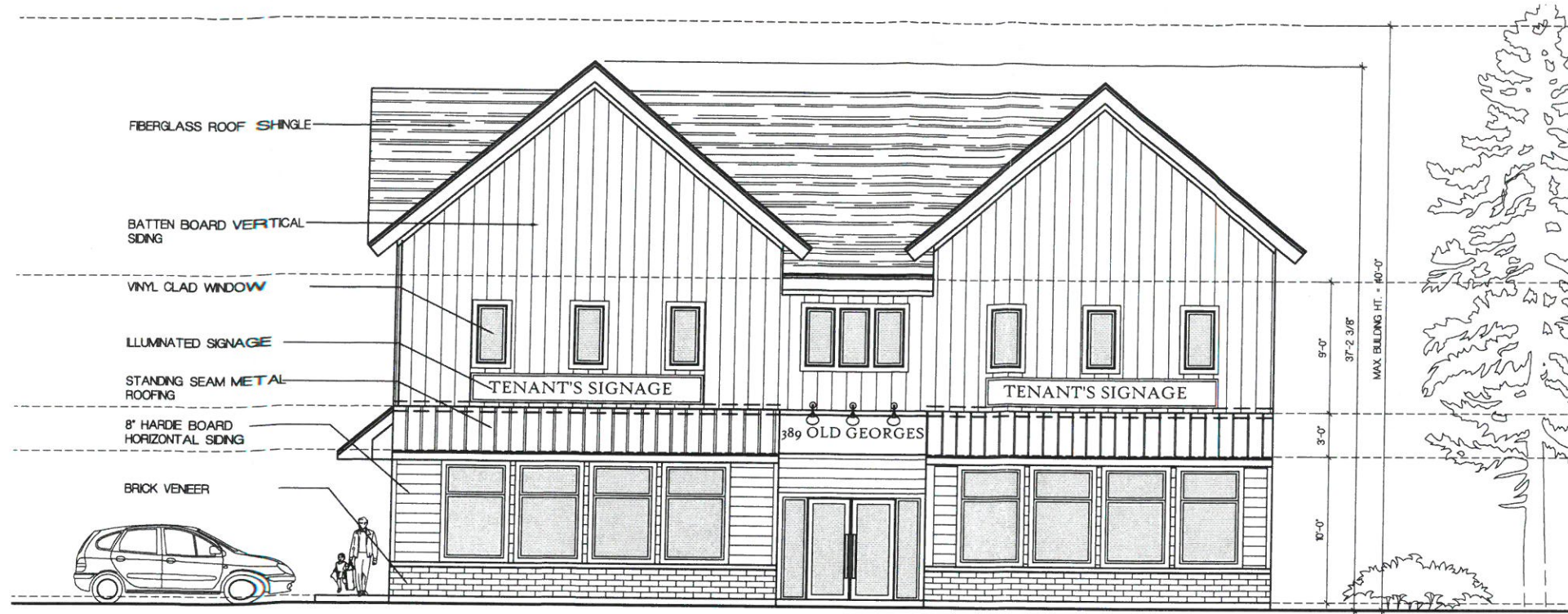
1 FRONT ELEVATION SCALE: 1/4"=1'-0"