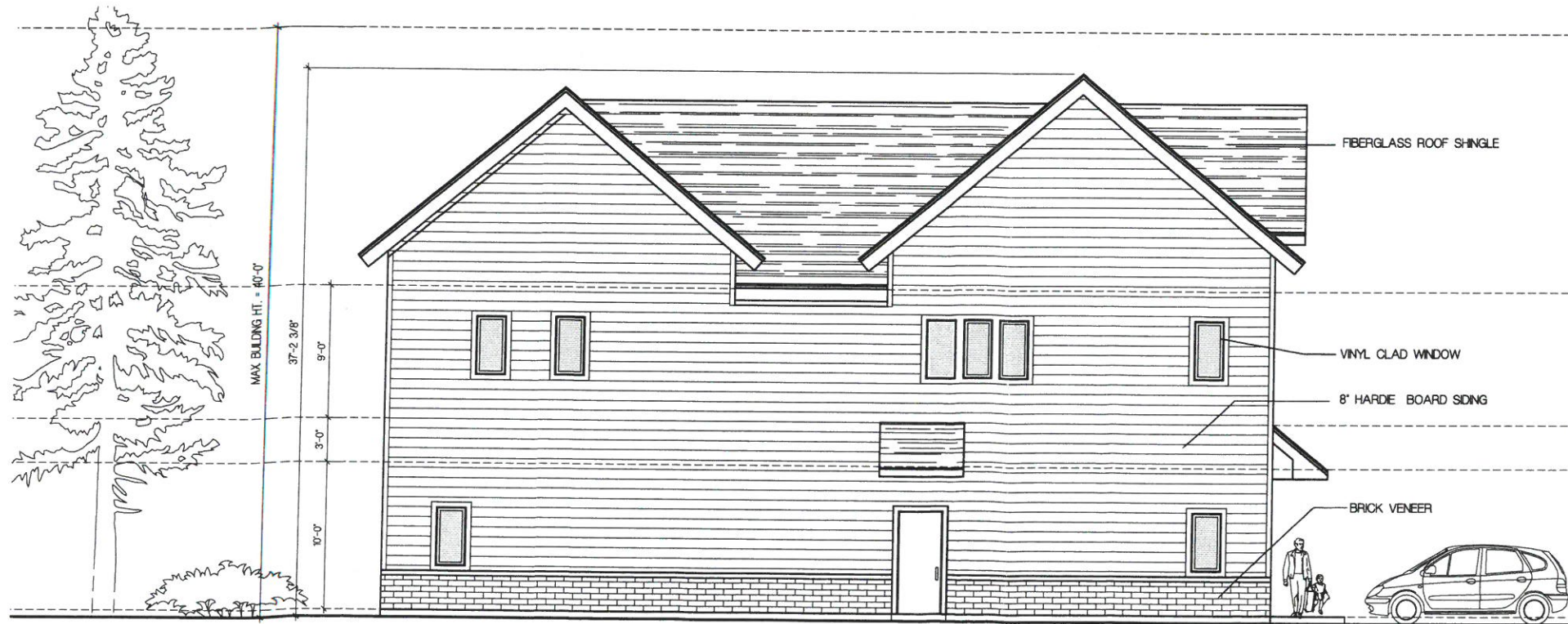
2 REAR ELEVATION SCALE: 1/4"=1'-0"