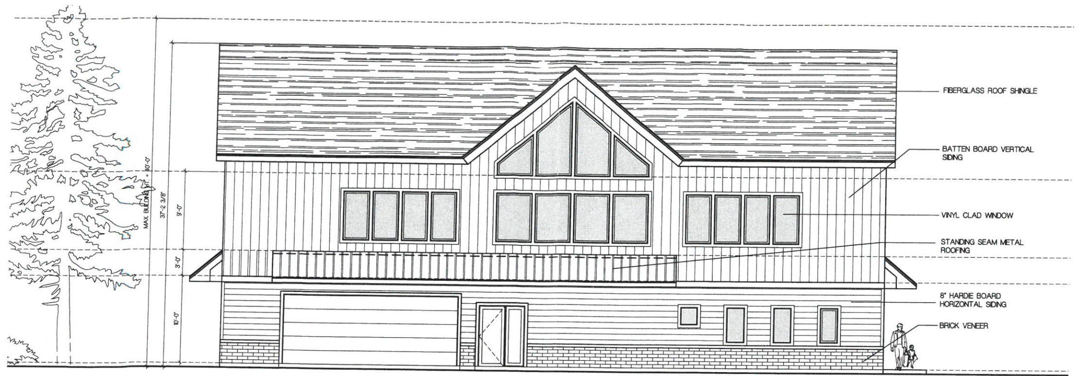
3 LEFT-SIDE ELEVATION SCALE: 1/4=1'-0"